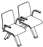
Beam 2 seater with / without arms