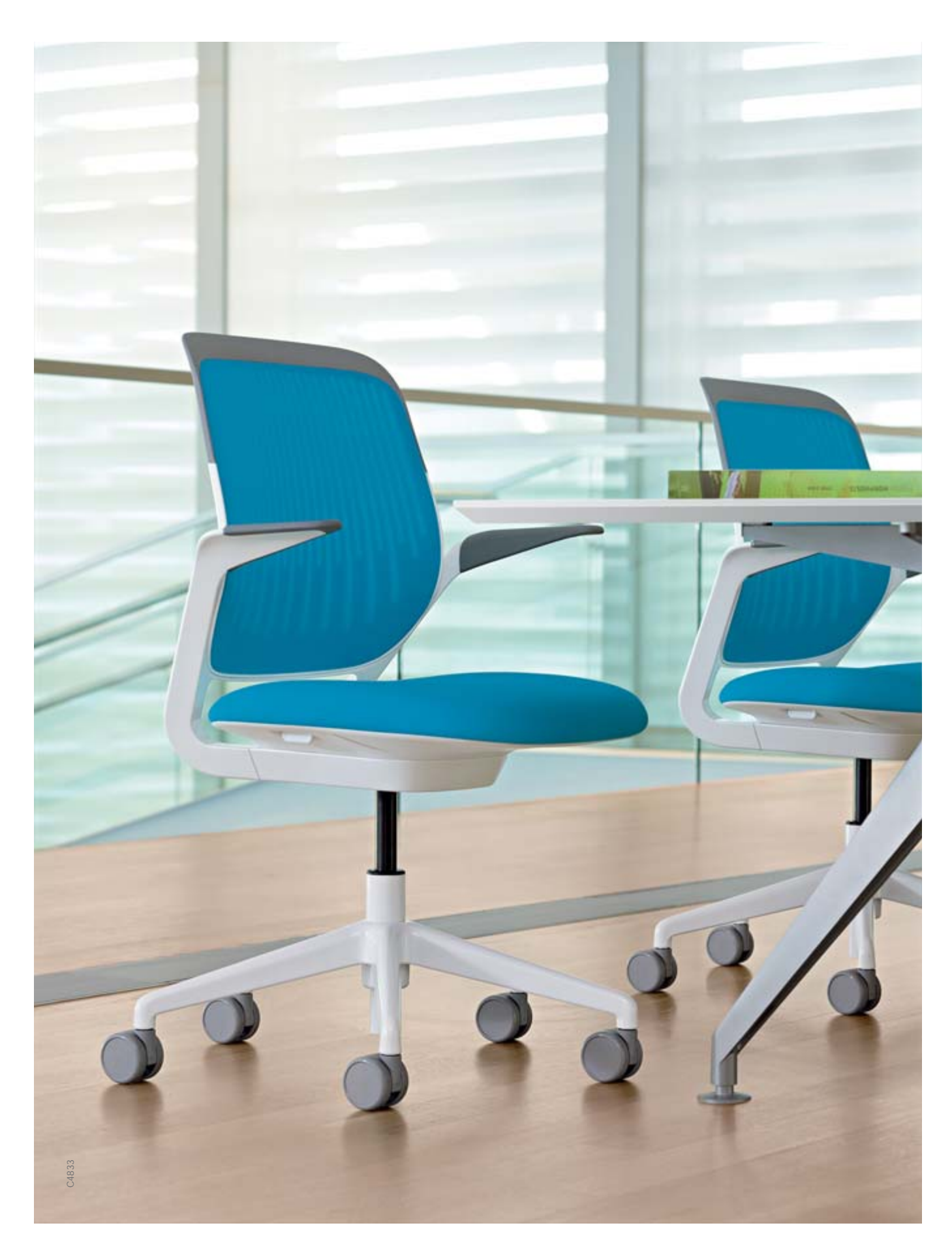
cobi chair with the 4.8 four point eight table