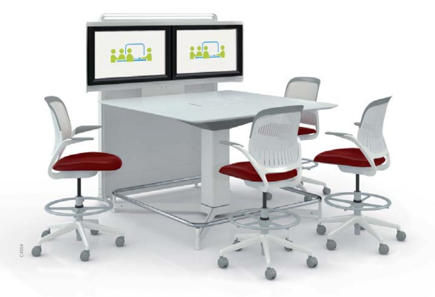
cobi draughtsman stool combined with media:scape

Effortless comfort and flexible support make cobi a versatile and valued partner in collaborative working.