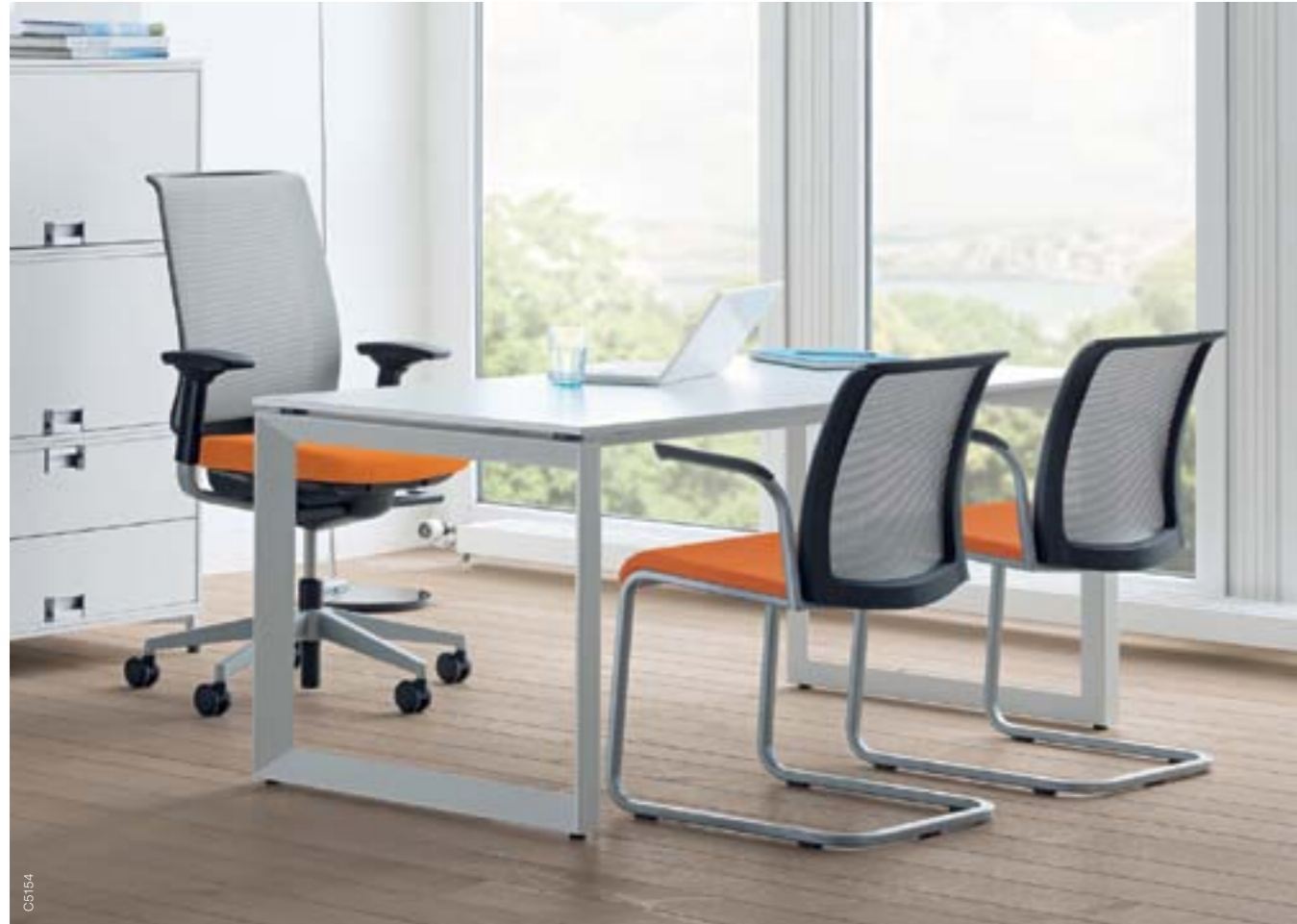
Individual space Eastside Air sled base with FrameOne Loop desk, FlexBox storage units and Reply Air task chair.

Eastside Air creates a sleek and stylish working environment for cutting-edge global businesses. The velvet touch of the fabric offers a nice sensation, keeping individuals relaxed.