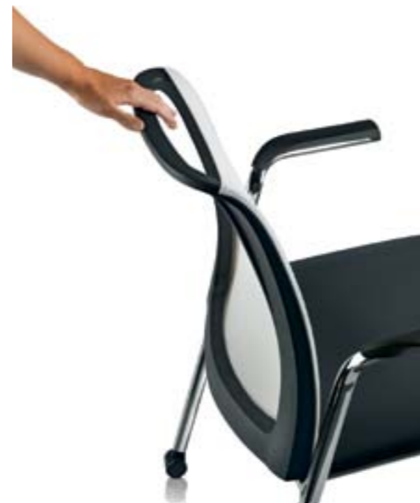
Complete with handle for easy movement, Eastside Air is the ultimate seating answer for any meeting room.