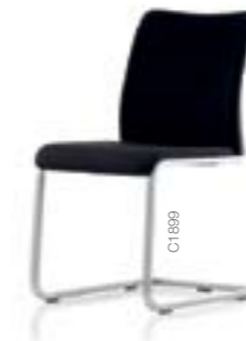
Eastside sled base Techno backrest and upholstered seat