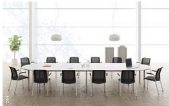
Collaborative space Eastside Air 4-legs with Kalidro Conferencing table.

Alternative innovations in Eastside Air take customised comfort to another level. It automatically and exactly adjusts to support an individual's spinal print. The tension of the mesh, and therefore the support it provides, adjusts according to the force placed on the backrest by the user.