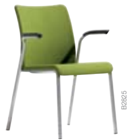
Eastside 4-legs base Upholstered backrest and seat