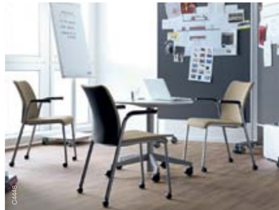
Small group meeting Eastside 4-legs with TouchDown2 table, Mobile Element flip-chart and pin boards.

As it can be moved easily, it is ideal for supporting collaborative work. Eastside is excellent for optimising space use as it can be stacked and stored effortlessly.