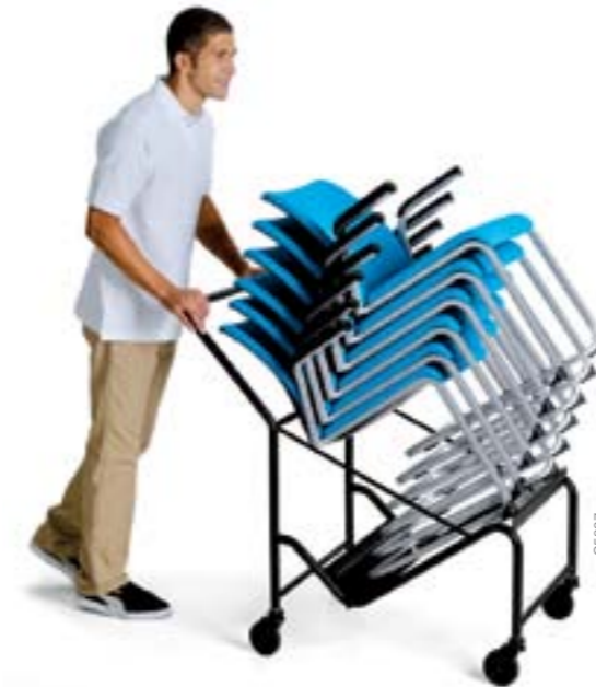
Eastside is stackable up to 6 chairs in 4-legs and sled base versions.