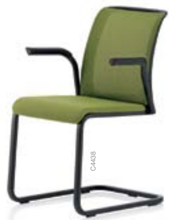
Eastside sled base Mesh backrest and upholstered seat