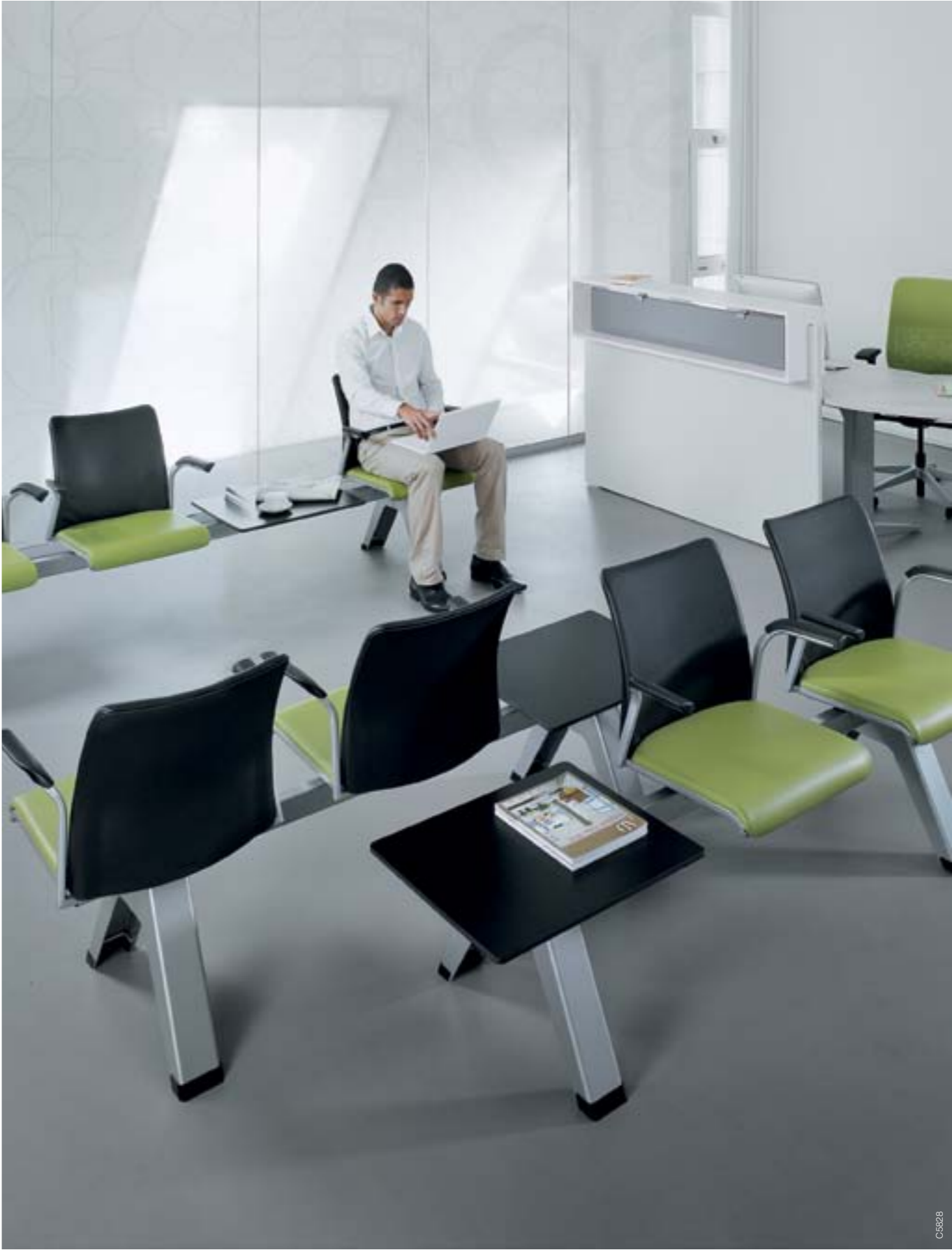
Eastside Beam with Softex upholstery in combination with Fusion reception counter and Reply task chair.