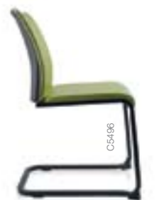
Eastside sled base Softex upholstery Stackable base