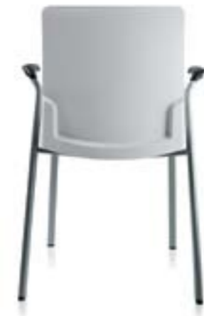
Eastside 4-legs base Plain backrest