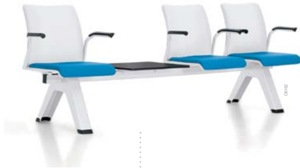
Eastside Beam Upholstered backrest and seat