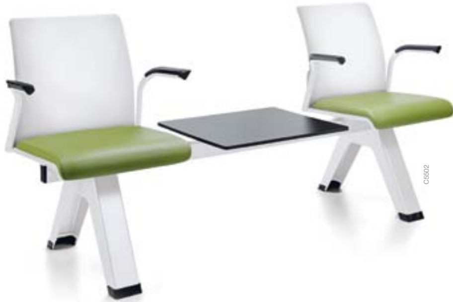
Eastside Beam with 2 seaters and tablet.

Ideal for your reception areas or waiting rooms, Eastside Beam comes in 2 to 4 chairs, with or without armrests, with a tablet as an option. For heavily used areas, the plain back version and Softex upholstery are easy to clean.